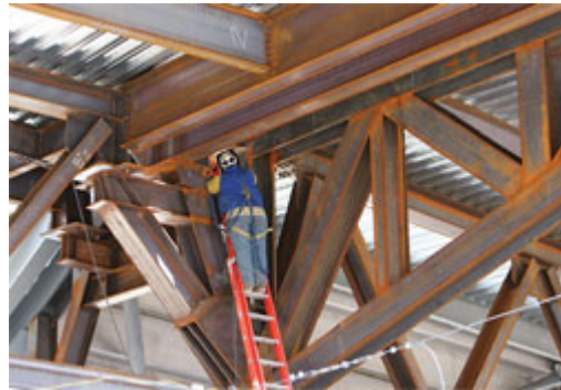
Steel had to be designed early to ensure mill order.