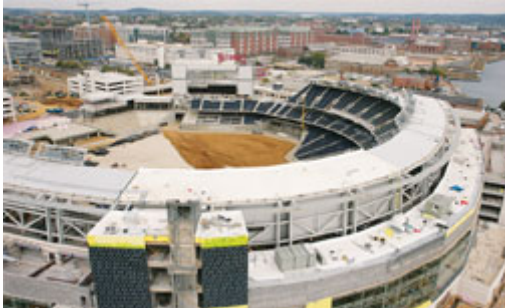
Ballpark, 85% complete, is on time and budget.

Paper shop drawings were produced from the model. Many of them were reviewed by the engineer before he issued final paper design documents. Almost like as-built drawings, the paper documents were intended to match the model, not the other way around. The unitprice arrangement reduced the reliance on paper documents, says Tamaro. "The final model allowed everyone to know exactly what the steel quantities were," he says.