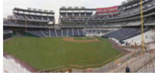
Ballpark is the first in the major leagues designed to conserve energy.