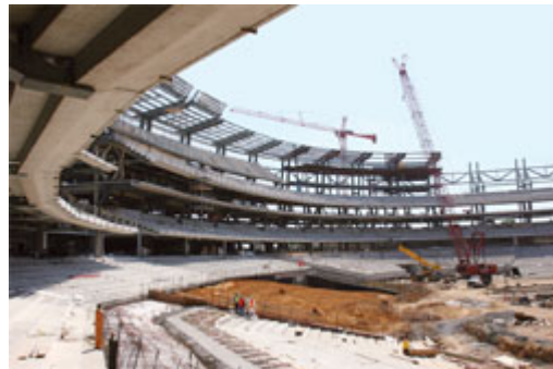
Job cut into discrete design and construction sequences, beginning on right field side, to save six months.